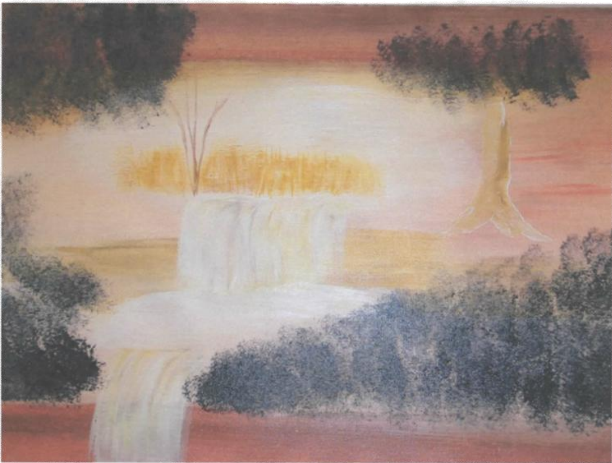
Tree and shrub foliage:

Load #8 Flat brush with Burnt Umber and paint distant tree with the chisel edge of brush at the top left of waterfall. Load #3/4 flat brush with Wicker White and Clear Medium, brush over area to make it look misty.